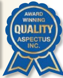
↓ No. 1884 1 3/8" x 1 5/8"