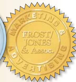
↓ No. 1883 2" dia.