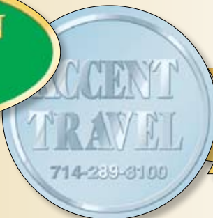
↓ No. 1113 2" dia.

Custom Sizes & Shapes Are Available, Call or Write for Pricing.