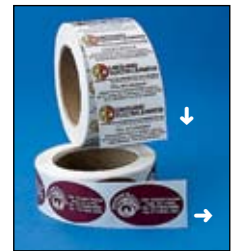
Arrows show standard unwind direction.

Custom Sizes & Shapes Are Available, Call or Write for Pricing.