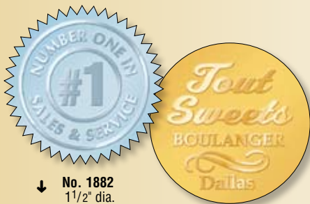
↓ No. 1882 1 1/2" dia.