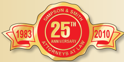
→ No. 1881 1 1/4" x 2 1/2"

Material Changes: Material changes are available at the combined quantity price plus $34.00 (E). Each change must be in multiples of 500. Emboss and background must remain the same on the entire order.