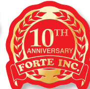
↓ No. 1885 1 3/16" x 1 1/4"